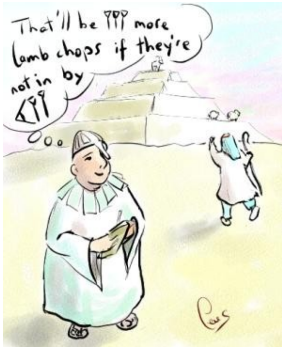
Figure 1: The real purpose of the ziggurat?

The application of mathematics to trade and financial affairs is as old as mathematics itself. History shows that as soon as a civilisation develops writing, including the writing of numbers, the new technology is used in financial transactions and the appropriate mathematical ideas develop rapidly.