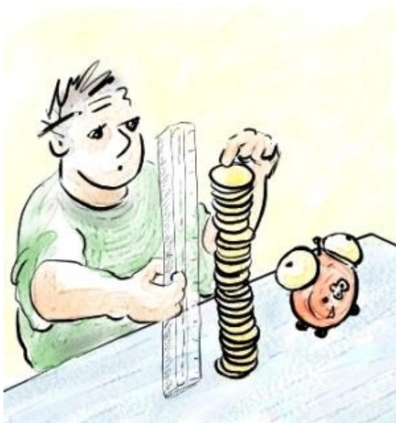
Figure 3: Time is money?